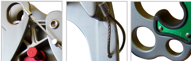
1 2 3

DIMENSIONS > LENGTH > 217mm WIDTH > 87mm THICKNESS > 30mm MATERIAL > HIGH STRENGTH ALUMINIUM. STAINLESS STEEL CAM MINIMUM BREAKING LOAD > TESTED ON 12.7 MM SUPERLINE . PRIMARY FAILURE OF ROPE SHEATH AT 2500 LBS (11KN). ASCENDER STILL OPERABLE. APPROVED STANDARDS > EN567. NFPA COMPLAINT FINISH > HARD ANODISED QUALITY > 100% INSPECTED WEIGHT > 364g